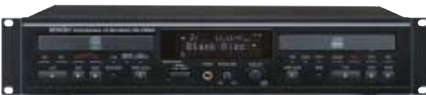
DN-C550R PROFESSIONAL CD-R/RW Recorder