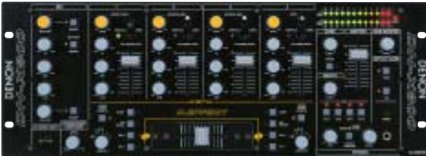
DN-X800 PROFESSIONAL Digital/Analog DJ Mixer with X-EFFECT